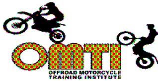
IMAGE FUND AT WORK

At the 2010 Calgary Motorcycle Show, the MMIC along with the Canadian National Sportsmen Shows, presented a grant to the Alberta Off-Highway Vehicle Association. The grant provided part funding for a new training group, The Offroad Motorcycle Training Institute. The following is a report of their first season of activity.